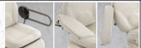
transfer support & bed rails hand/forearm surgery table 3 IV & surgery 3

Choose from multiple arm options. Our patented Splines System™ provides quick and easy attachment and removal of accessories.