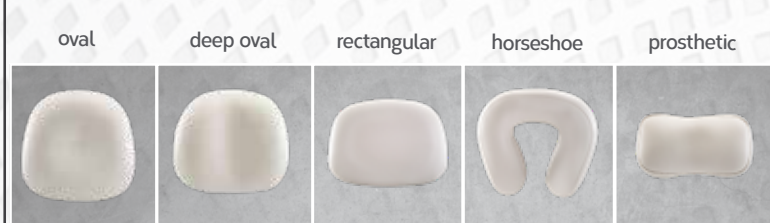
oval deep oval rectangular horseshoe prosthetic