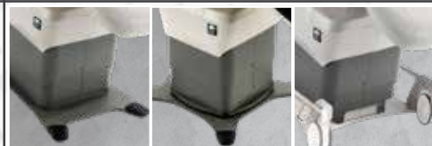
standard swivel mobile

Choose one of three ADA Compliant bases. The Swivel Base's Safe Swivel™ lock can be set to a Lock/Unlock or Auto-Lock setting. For safety, the swivel auto-locks during unsafe movements. While swiveling the chair, the power and foot control cords do not swivel with the chair.