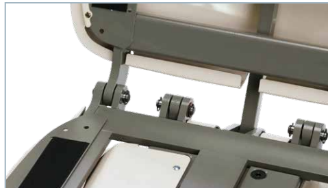
Supported by a welded steel frame with maintenance-free joints and unsurpassed strength for better sturdiness under greater loads.