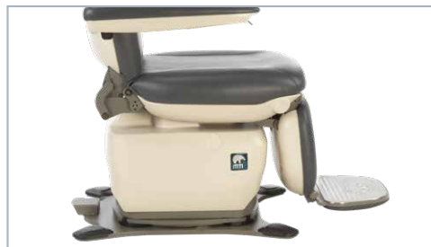
ADA Compliant chairs with an 18.75" entry height feature automatic power footrest extensions.