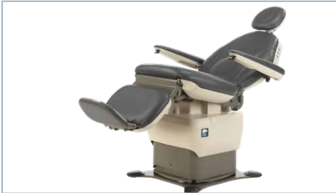
Ultra quiet DC motors are 30% faster and an unmatched patient capacity rating of 725 lb. The soft and sleek design defines luxury and provides superior patient access.