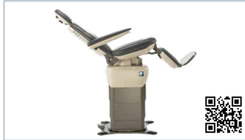
ComfortSync™ provides independent, smooth movements of the leg rest and footrest as it follows the natural relationship of the patient's resting legs and feet.