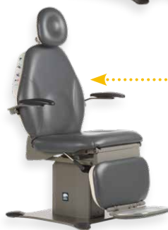
461 EXAM CHAIR