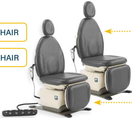
829 PROCEDURE CHAIR