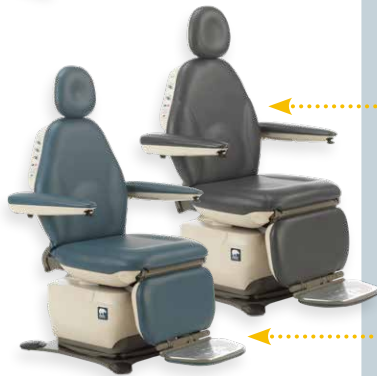
464 EXAM/PROCEDURE CHAIR