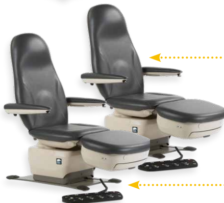
528 PODIATRY/ WOUND CARE CHAIR