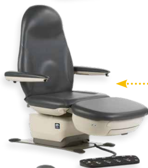
529W BARIATRIC PODIATRY/WOUND CARE CHAIR