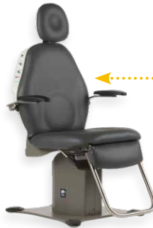
403 EXAM CHAIR