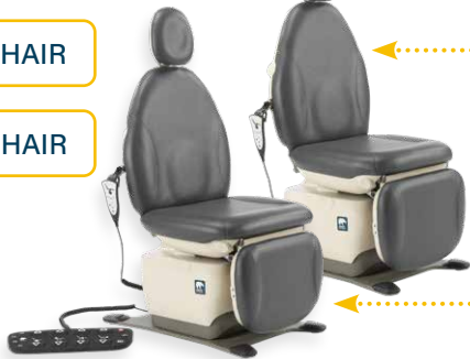
830 PROCEDURE CHAIR