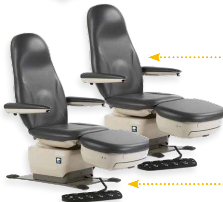
529 PODIATRY/ WOUND CARE CHAIR