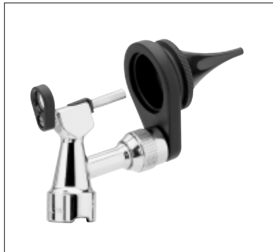
21700 3.5v Operating Otoscope

U.S. Patent No. 4,006,738 and international patents.