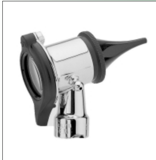
20200 3.5v Pneumatic Otoscope

Welch Allyn will repair or replace, free of charge, any parts of its own manufacture proven to be defective through causes other than misuse, neglect, damage in shipment, or normal wear.