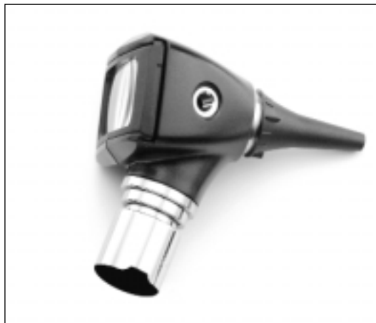
25020 3.5v Diagnostic Otoscope

Welch Allyn will repair or replace, free of charge, any parts of its own manufacture proven to be defective through causes other than misuse, neglect, damage in shipment, or normal wear.