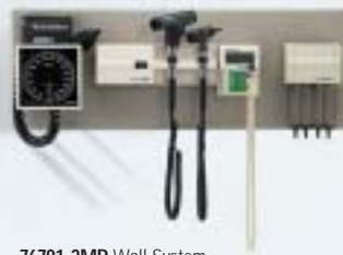
76791-2MP Wall System