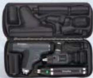
97200-MPS Diagnostic Set