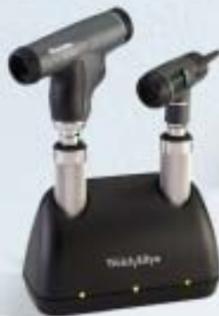
71811-MP Desk Charger Set