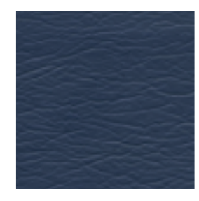
Diplomat Blue 291-2478