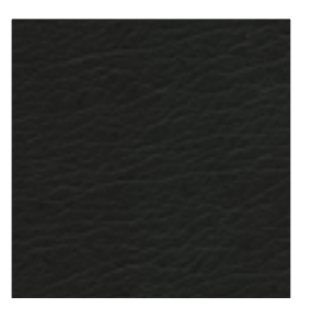
Raven Wing 291-5607