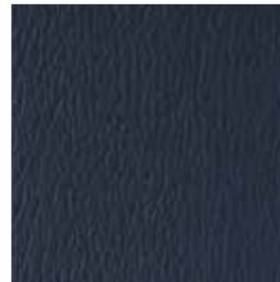
Midnight Blue 239