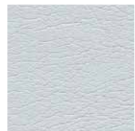
Silver Pearl 246