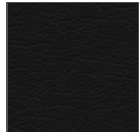
Raven Wing 225