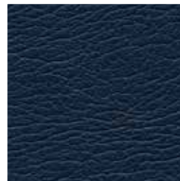
Diplomat Blue 236