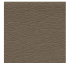
Pine Cone 243