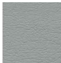
Dove Grey 245