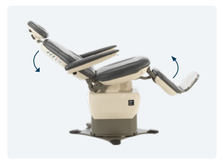
Coordinated Movement Backrest and footrest move in sync