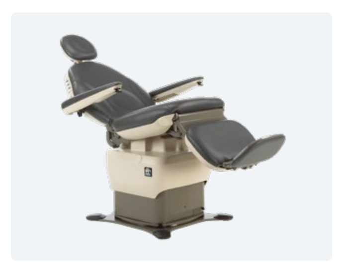
464 Exam / Procedure Chair

The backrest is powered and moves in sync with the footrest, ensuring continuous support for the patient as the chair reclines. This coordinated movement is fixed and cannot be adjusted independently.