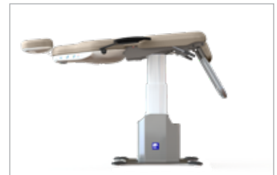
The 403 back reclines to flat position with 5° of decline