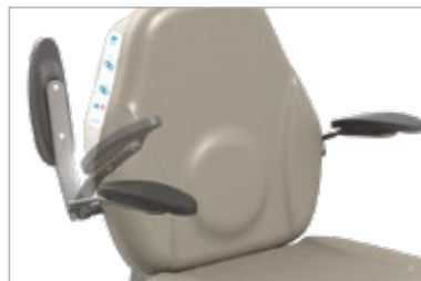
Flip-up floating arms on the 461 and 403 provide easy ingress and egress for patients