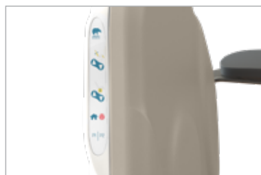
EasyView™ chair back mounted membrane hand switches come standard on both the 461 and 403 Exam Chairs