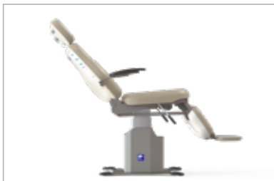
The powered back with coordinated footrest on the 461 supports the patient as backrest reclines