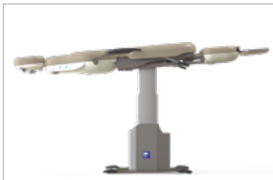
The 461 reclines to flat position with 5° of decline