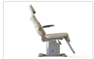
The sturdy looped footrest remains at comfortable fixed angle on the 403 to support patients' feet