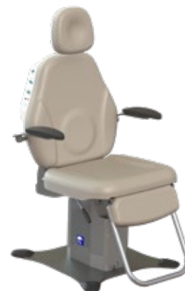
MTI 403 Exam Chair