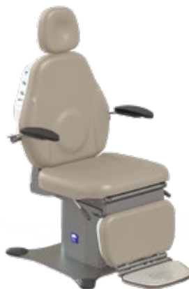
MTI 461 Exam Chair