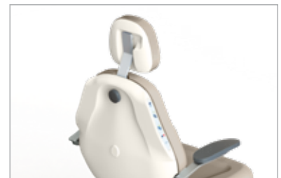
Tapered back on 403 provides easier access to patients & comes with non-articulating oval headrest