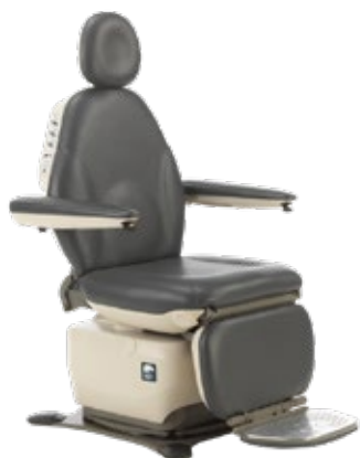
MTI 463/464 Exam Chairs