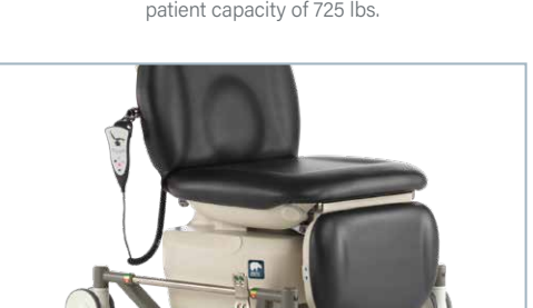
power footrest extension and extend/retract buttons for independent movements.