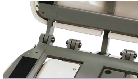
Supported by a welded steel frame with maintenance-free joints and unsurpassed strength supporting a patient capacity of 725 lbs.

head and neck area with less strain on the caregiver.