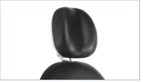
Customizable Ophthalmic Headrest adjusts and locks firmly in place with just a 1/4-turn in just seconds.

A fundamental advantage to MTI's products is the tapered