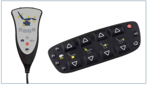
Available hand and foot controls with sealed membrane for easy cleaning and disinfecting.