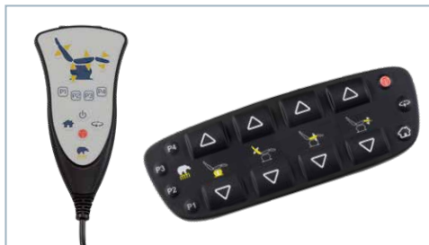
Hand and Foot controls with sealed membrane for easy cleaning and disinfecting.