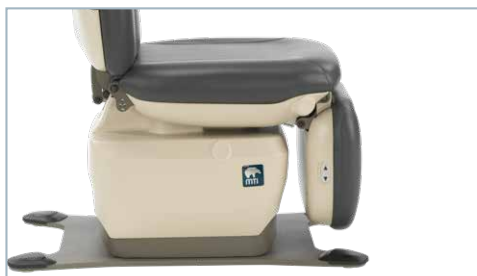
ADA Compliant 18.75" entry height with 7" automatic power footrest extension and extend/retract buttons for independent movements.