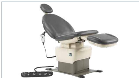
Ultra quiet DC motors are 30% faster and at 725 lb rating, our latest chairs have an unmatched patient rating capacity.