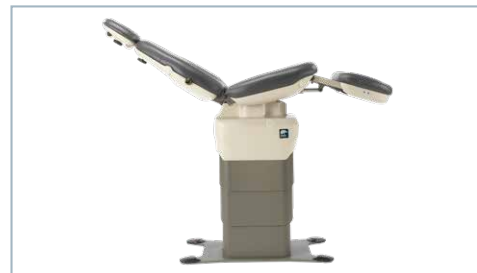
The soft and sleek design defines luxury and provides superior patient access.