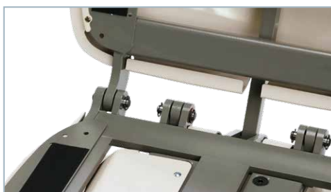
Supported by a welded steel frame with maintenance-free joints and unsurpassed strength supporting a patient capacity of 725 lbs.