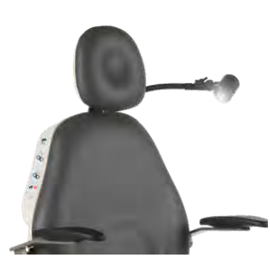
Exam Light (Chair Back Mounted)

Choose from various G2 plug and play accessories to customize your chair for any exam or procedure.