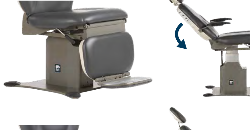
461 Coordinated Leg Rest with Flip-up Footrest

The powered back with coordinated footrest on the 461 supports the patient as the backrest reclines. The footrest is able to be flipped up, with a cushioned back to provide comfort for the patient while seated or in the prone and supine positions and cleaner access around the chair. The 403 is built with a sturdy stainless steel looped footrest, which remains at a comfortable fixed angle to support patients' feet.