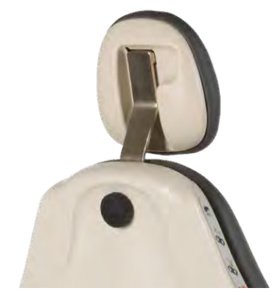
403 - Non-Articulating Headrest