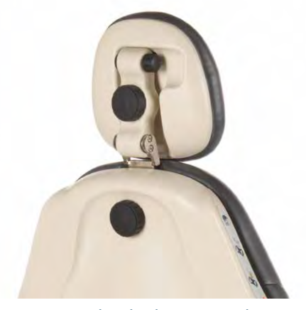
461 - Articulating Headrest