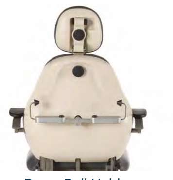
Paper Roll Holder 18-21" Adjustable